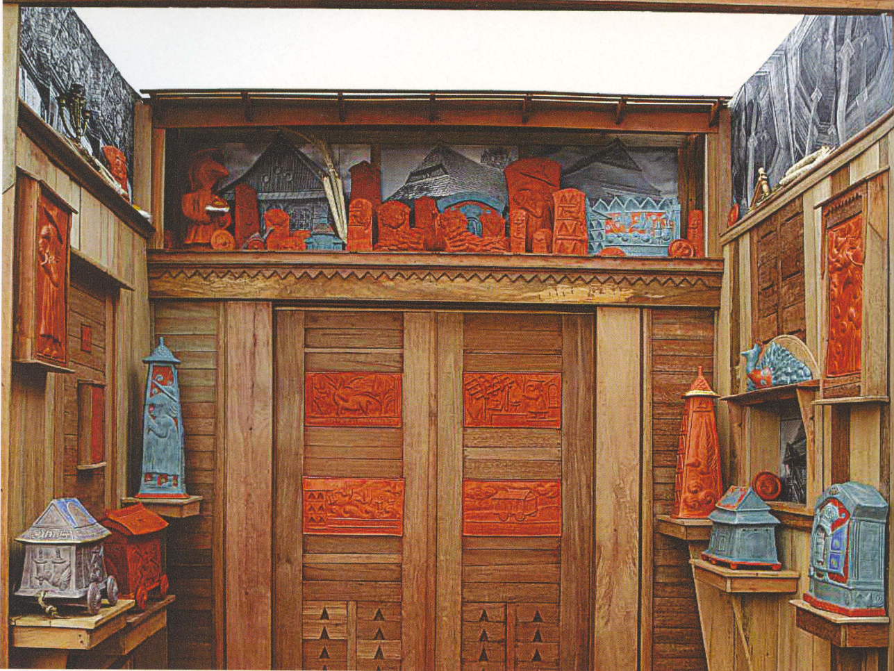
Slonim Revisited . 2007. Earthenware, wood, paper, found objects. 3 x 2.7 x 1.7 m.

looks out on to a black and white photo of a wooden synagogue and provides a view of a long vanished East European landscape. Looking up we see similar pictures bordering the edges of the walls. Elements like these make us feel like the inhabitants of the shelter. When we look at the smaller house-shaped clay objects on pedestals and peer into their doors and windows, we become spectators, on the outside looking in. Prominently displayed on the central wall is the set of doors bearing the clay panels which could symbolise the doors to the ark or even doors to other worlds. Their meaning like much else in this installation depends on where we choose to position ourselves – on the inside or outside. It is in this dialogue between self and location that the vitality of Leader's images of home can ultimately be experienced and understood.