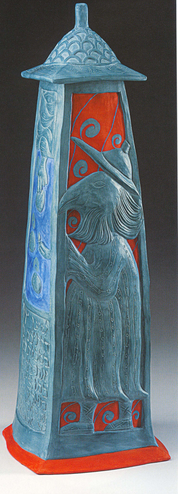
Harvest in Beregovo . 2006. Earthenware, terrasi­gillata. 63.5 x 27.9 x 20.3 cm.