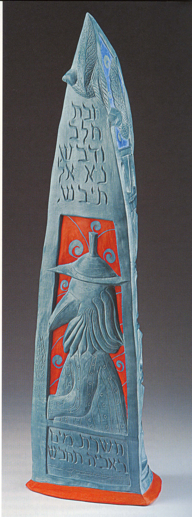
Offering for Orgeyev. 2006. Earthenware, terrassigillata. 76.2 x 27.9 x 20.3 cm.

A shelter whether temporary or permanent, religious or secular, is a space created for human habitation and like all inhabited space it bears the essence of the notion of home. The symbol of the shelter as house/home is the conceptual core of the installation around which Leader overlays various images. The metaphor of home permeates the images whether they are of the sukkah, of doves flying to their cote, or the wooden structure within which the images are housed. Also implicit in the theme of home is the artist's awareness of the phenomenon of displacement. Leader jokingly refers to the installation as an opportunity to make a space and sell it but still have a house to live in, thereby combining the experiences of home and exile, and the temporary and the permanent. The recurring use of wheels and ropes on his house-shaped sculptures and ritual objects, are not only references to his favorite childhood pull-toy but