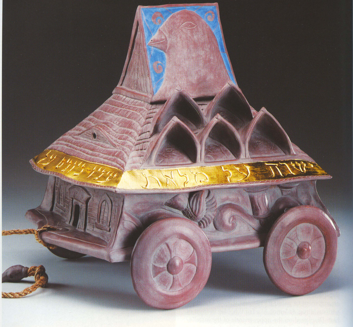
Sadgora. 2006. Earthenware, terra sigillata, gold leaf, rope. 40.6 x 40.6 x 40.6 cm.