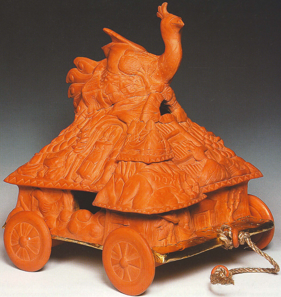
Slonim Dreams . 2006. Earthenware, terrasisillata, gold leaf, rope. 48.3 x 38.1 x 38.1 cm.

overlapping images, born out of Leader's memories and imagination, constructing a rich narrative.